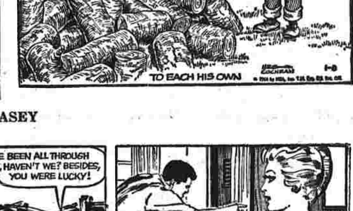
BY DICK CAVALI