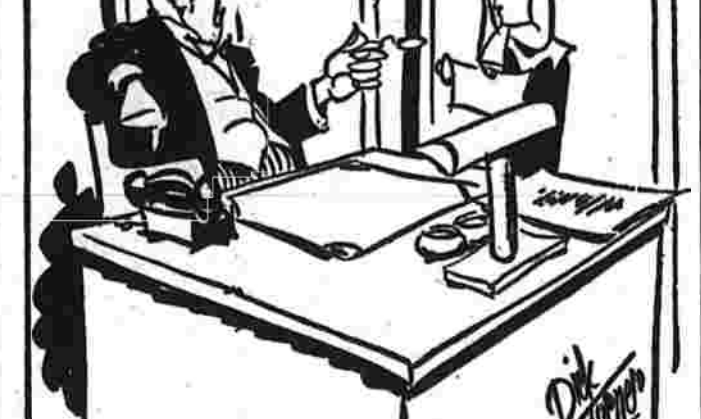
BY JOE CAMPBELL